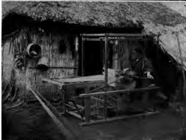
SEPARATING THE WHEAT HEADS FROM THE STRAW AT THE LOOM